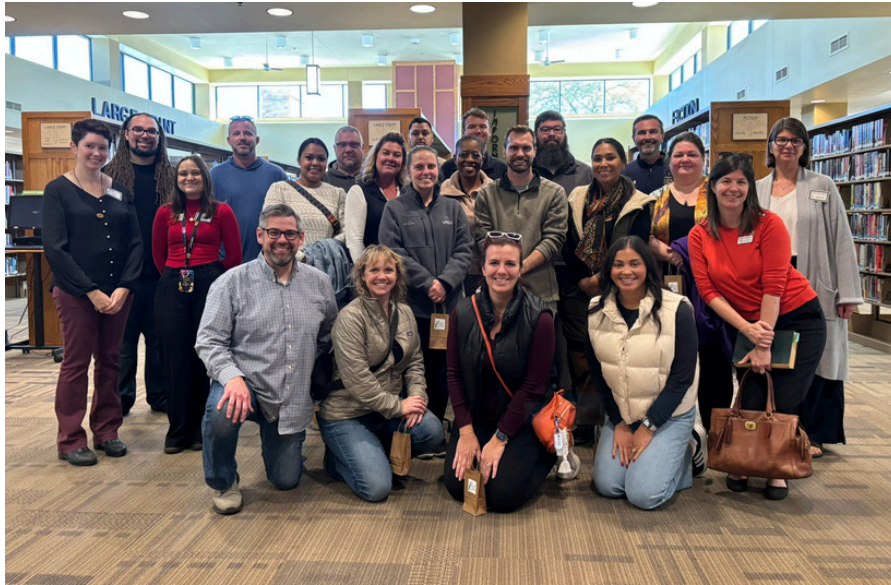
2025-2026 Leadership Connect Cohort

Leadership Connect is a comprehensive community leadership program that focuses on community awareness and personal leadership. This 9-month program kicks off with an overnight retreat followed by monthly day sessions and conversations on community, economy, education, nonprofit, public safety, health services and state government. The program concludes with a team building wrap up session combined with volunteering at Community Impact Day.