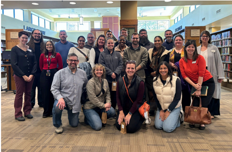
2025-2026 Leadership Connect Cohort

Leadership Connect is a comprehensive community leadership program that focuses on community awareness and personal leadership. This 9-month program kicks off with an overnight retreat followed by monthly day sessions and conversations on community, economy, education, nonprofit, public safety, health services and state government. The program concludes with a team building wrap up session combined with volunteering at Community Impact Day.