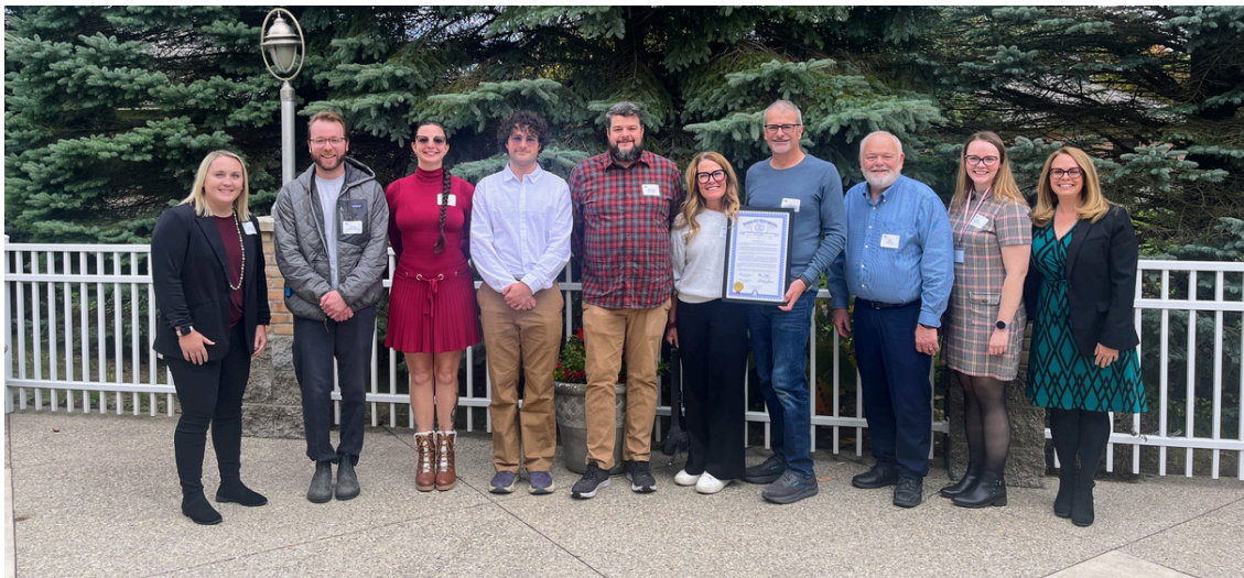
Off the Chain Brewstillery