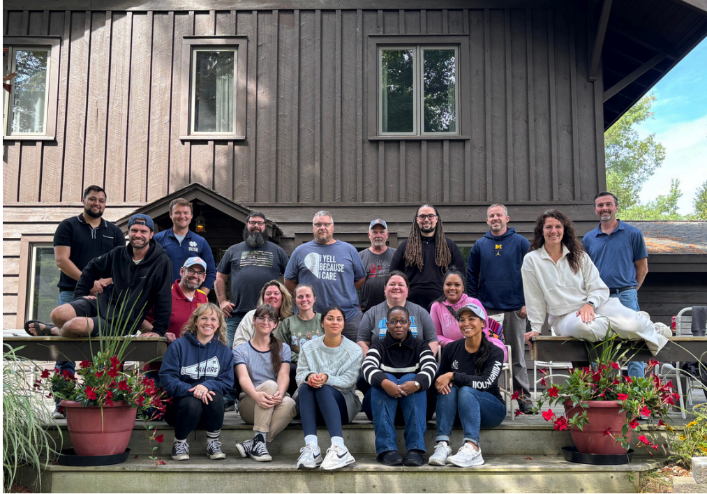
Leadership Connect Cohort 2025-2026