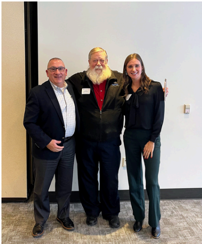
Forum on Transportation